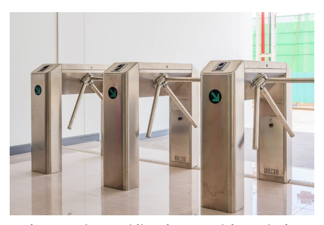
at the same time avoiding the potential security loopholes that come with global passphrases.

Since early 2000, LANCOM's LEPS-MAC (LANCOM Enhanced Password Security MAC) has allowed operators to avoid the insecurities of using a global passphrase. As of LCOS 10.20, LANCOM offers a further highly efficient method based on the PPSK method and called LEPS-U (LANCOM Enhanced Passphrase Security User). With LEPS-U, you have the ease of configuration of IEEE 802.11i plus passphrase, while